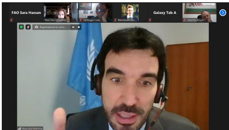
Mr. Maurizio Martina , ADG / Special Adviser to the Director General– UN Food and Agriculture Organization